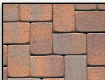
Valencia "A"s - Herringbone Pattern