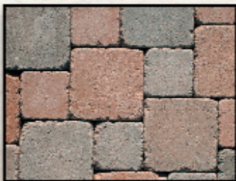
Valencia "B"s and Terrazos - Pinwheel Pattern