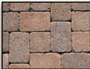
Valencia "A"s and "B"s - "K" Pattern