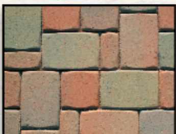
Valencia "A"s, "B"s, and "C"s - Random