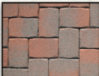
Valencia "A"s - Herringbone Pattern