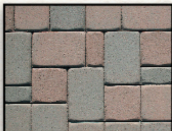
Valencia "A"s, "B"s, and "C"s - Random