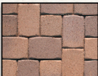
Valencia "A"s and "B"s - "K" Pattern