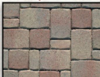
Valencia "A"s, "B"s, and "C"s - Random