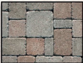
Valencia "A"s, "B"s, "C"s, and Terrazos - Random